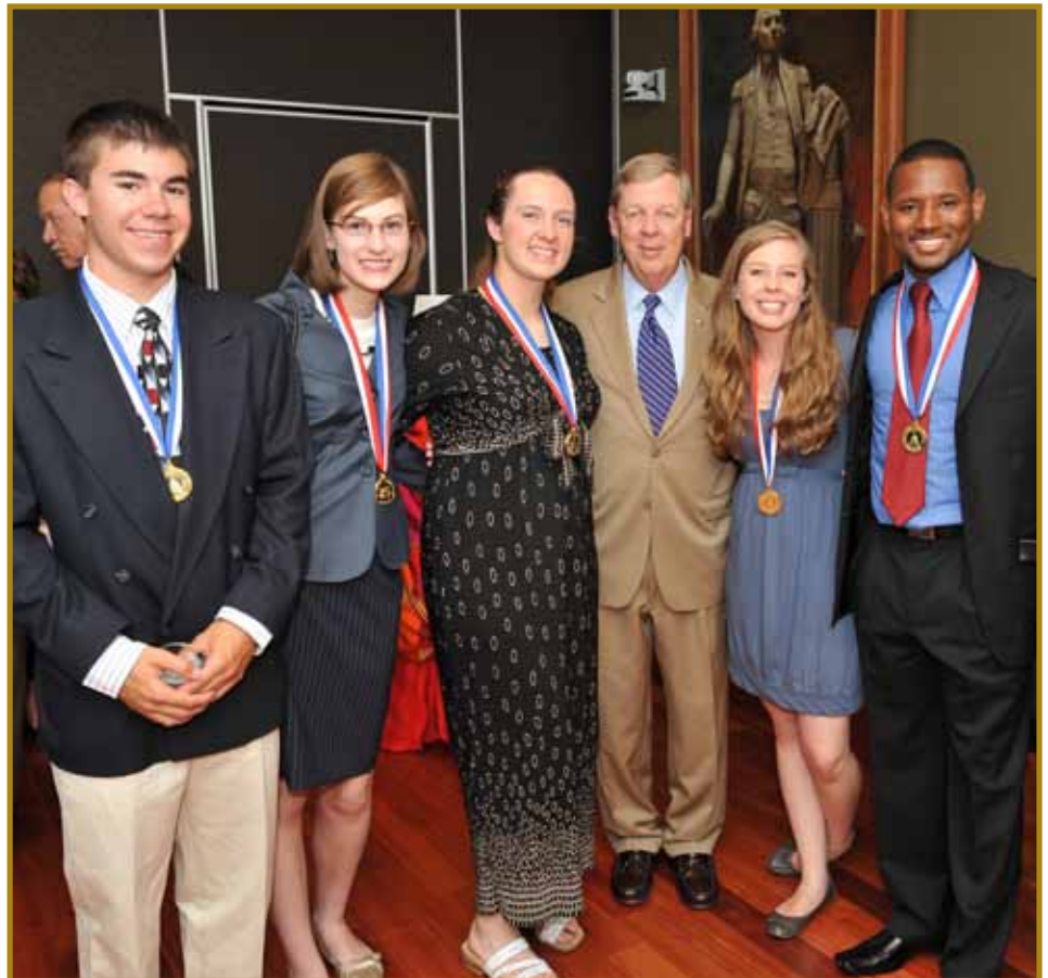
Senator Johnny Isakson (R-GA), a Congressional Award Board Member, welcomes medalists as one of the Co-Chairs of the Annual Youth Wellness Dinner.

The Congressional Award Foundation hosts an annual dinner with members of the Senate Health, Education, Labor and Pensions (HELP) Committee, and the House Energy and Commerce Committee to raise awareness of this congressional program for youth. Formerly chaired by the late Senator Ted Kennedy, this annual dinner advocates the importance of civic engagement and physical health and fitness for youth – two of the main components of the Congressional Award program. As child obesity is an issue that continues to be an ongoing focus in the Senate HELP and House Energy & Commerce Committees, the Congressional Award program encourages the types of activities that promote fitness and can prevent this epidemic from spreading to future generations of young people.