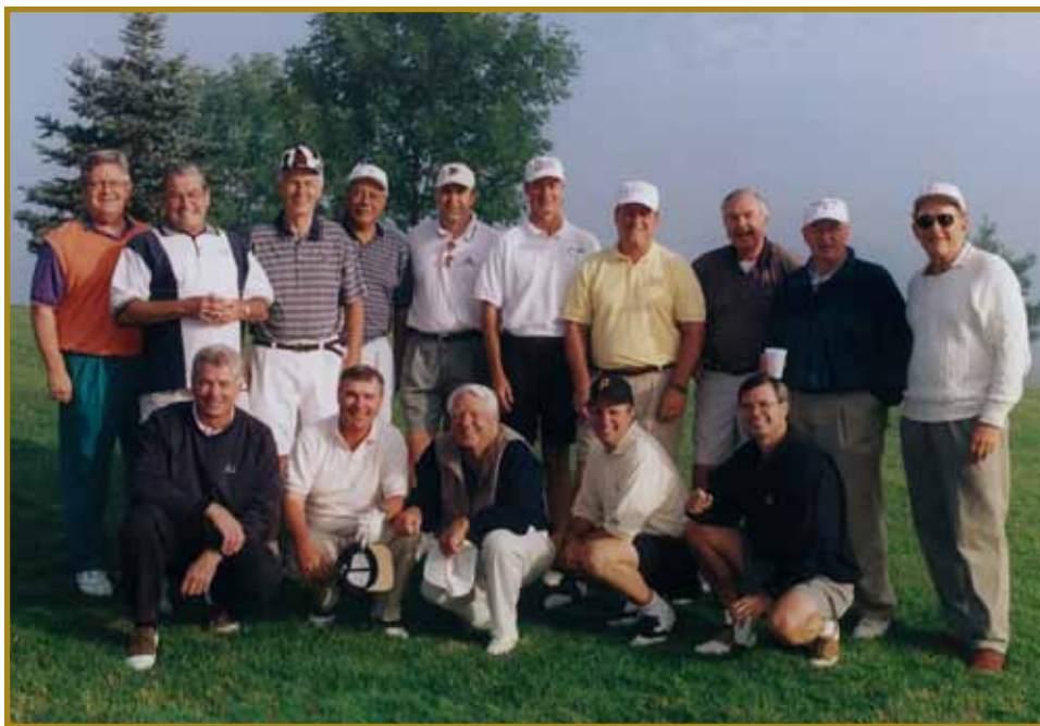
Current and former Members of Congress join forces in support of Congress' charity for youth.

The Congressional Award has recognized so many young Army and Navy soldiers for their achievements in the past, as well as the dependants of military personnel who live on bases throughout the world. In light of this partnership, and its proximity to the US Capitol Building, the Army Navy Country Club is a fitting venue for this tournament. Members of the Army Navy Country Club have included Presidents Dwight D. Eisenhower, John F. Kennedy, Lyndon B. Johnson, Richard M. Nixon, and William J. Clinton.