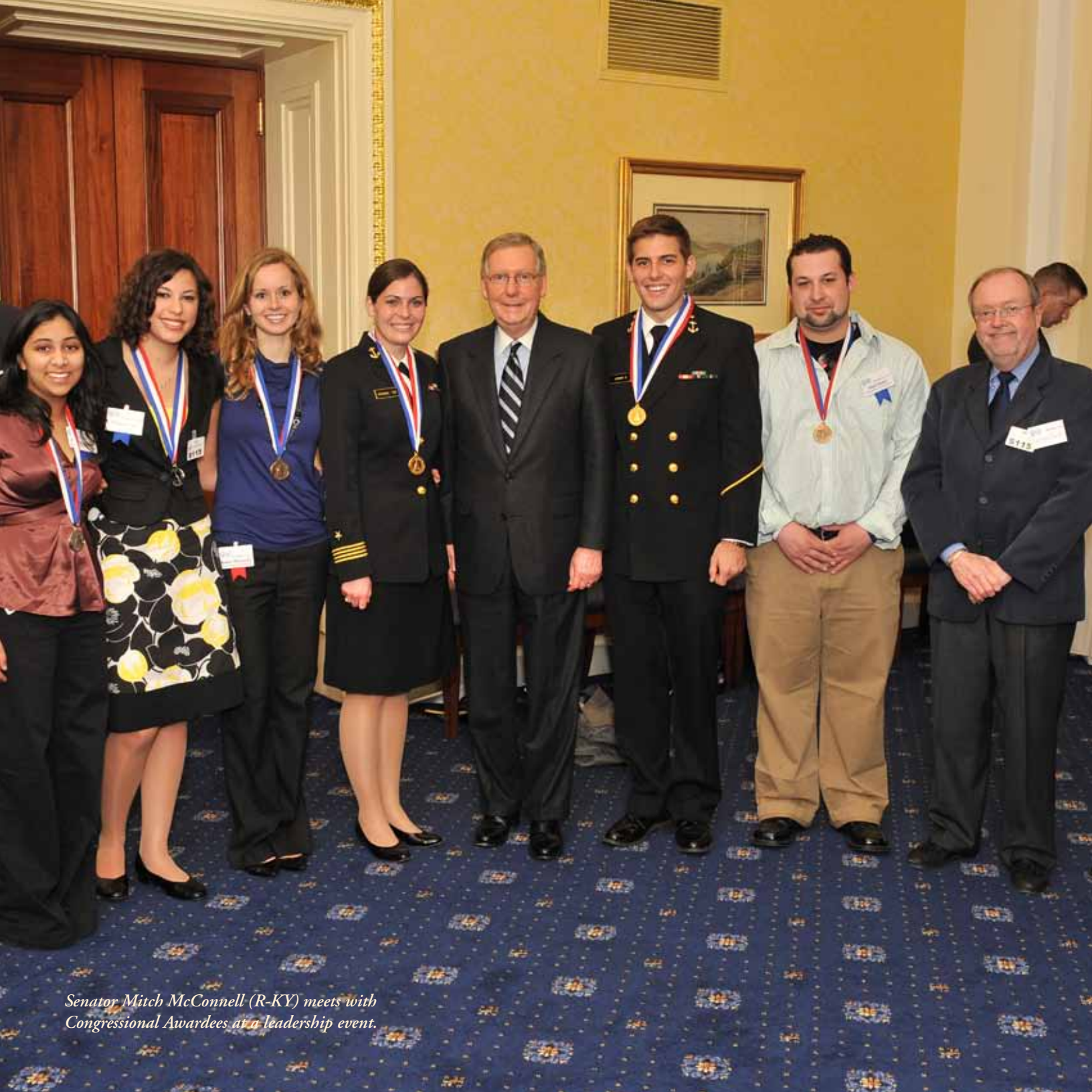
Senator Mitch McConnell (R-KY) meets with Congressional Awardees at a leadership event.