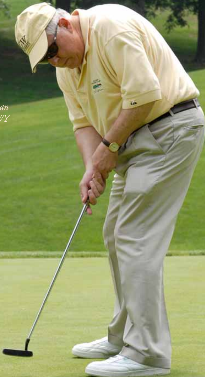
Senator Mike Enzi (R-WY) sinks a putt at the Annual Congressional Award Golf Tournament fundraiser in Arlington, VA.