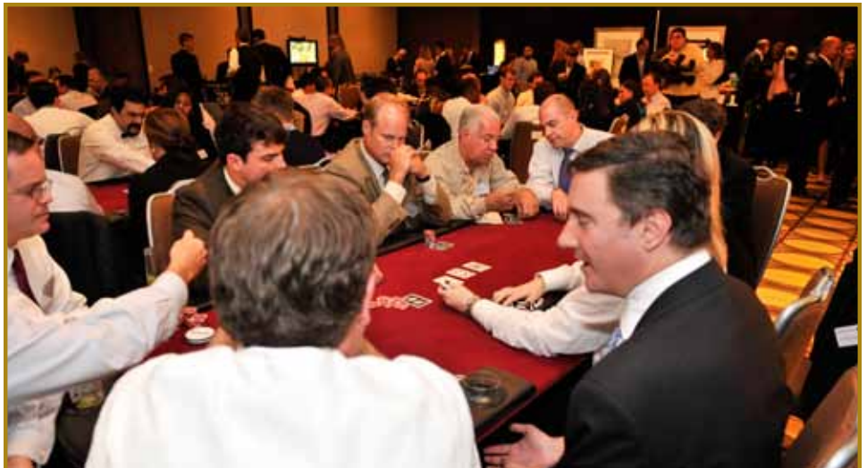
A packed house at the Annual Poker Tournament.