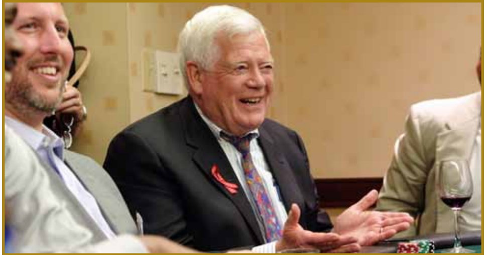
Congressman Jim McDermott (D-7th-WA) joins other members of Congress and congressional staff to support the Congressional Award at the Charity Poker Event.