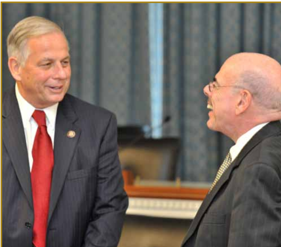
Congressman Henry Waxman (D-30th-CA) speaks to Congressman Gene Green (D-29th-TX) at the Congressional Award event on Capitol Hill.

The Congressional Award Foundation hosts an annual dinner with members of the Senate Commerce, Science and Transportation Committee, and House Energy and Commerce Committee to advocate the importance of civic engagement among young people and the critical role technology plays to bring youth of all backgrounds together to serve a common purpose. The digital world has served to strengthen various forms of youth engagement. Technology has increased youth awareness of issues, problems and crises in their own communities as well as other parts of the world. It has become a powerful tool for communication and coordination of youth movements and creating a sense of solidarity among youth of all backgrounds.