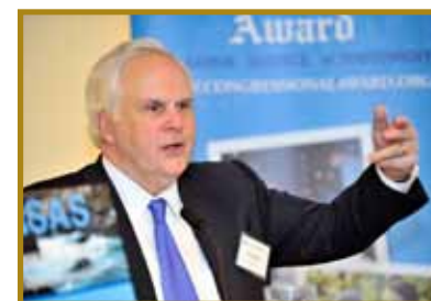
FedEx Chairman and Founder, Fred Smith, speaks as the title sponsor of the Arkansas Congressional Award Dinner honoring Senator David Pryor.