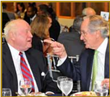
Senator Tom Harkin (D-IA) and former Iowa Senator John Culver enjoy the dinner before giving their remarks.

–Congressional Award Gold Medal Parent ★ Jupiter, FL