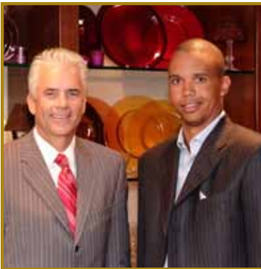
Senator John Ensign (R-NV) meets Phil Ivey before the start of the game.