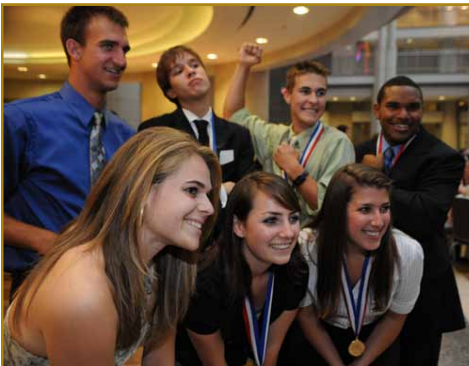
Gold Medalists celebrate their accomplishments after the Gold Medal Ceremony.

The ceremony is the highlight of a week-long program hosted by the foundation, which is filled with a touring program for medalists to connect and explore Washington, DC and a larger celebratory event for families and supporters to recognize these deserving youth. Since its inception, the Congressional Award has recognized approximately 3,000 Gold Medalists.