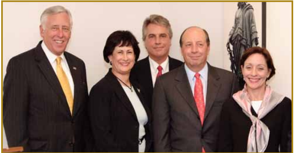
The Honorable Steny Hoyer (D-5th-MD) thanks AEGON for supporting the Congressional Award program in Maryland.

While the Congressional Award Foundation is a national organization, the program is delivered locally where the needs of each community are served. We strongly believe that the future of America's youth is reached one individual at a time.