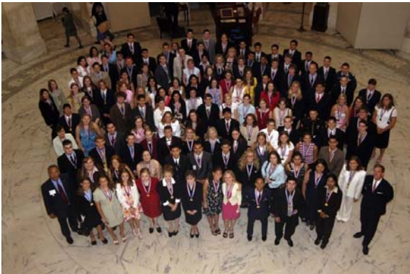
Above: The 2004 Gold Medalists in the rotunda of the Russell Senate Office Building.