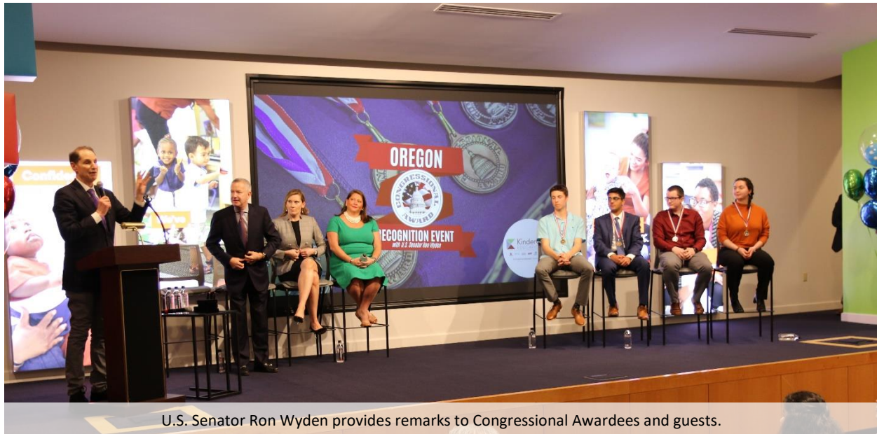
U.S. Senator Ron Wyden provides remarks to Congressional Awardees and guests.

United States Senator Ron Wyden recognized student leaders with Congressional Award Medals and offered a Q&A for constituents to address today's most pressing issues and local opportunities.